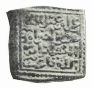
عن امرعبد الله عبد الحق امير المسلمين ايده الله تازي

As Arroyo indicates for his type 4 the spelling of TAZA is not the usual one.