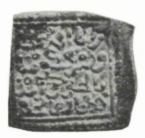
ربنا افتح بيننا وبين قومنا بالحق وانت حير الفاتحين Koran VII-87